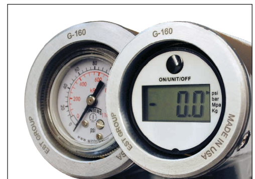
Analog and optional Digital gauges